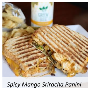
Spicy Mango Sriracha Panini

Consuming raw or undercooked meat or eggs may increase your risk of foodborne illness.