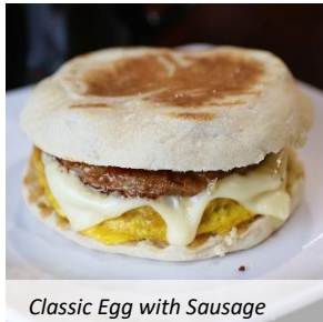
Classic Egg with Sausage