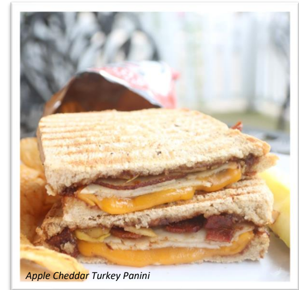
Apple Cheddar Turkey Panini

Naturally healthy cuisine served with a ❤️ of welcome.