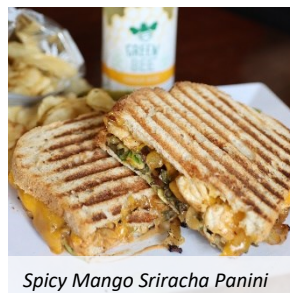
Spicy Mango Sriracha Panini

Maui BBQ Chicken .....half $ 7.55 ... $ 12.25 chicken, onion, lettuce, pineapple, BBQ sauce, cheddar